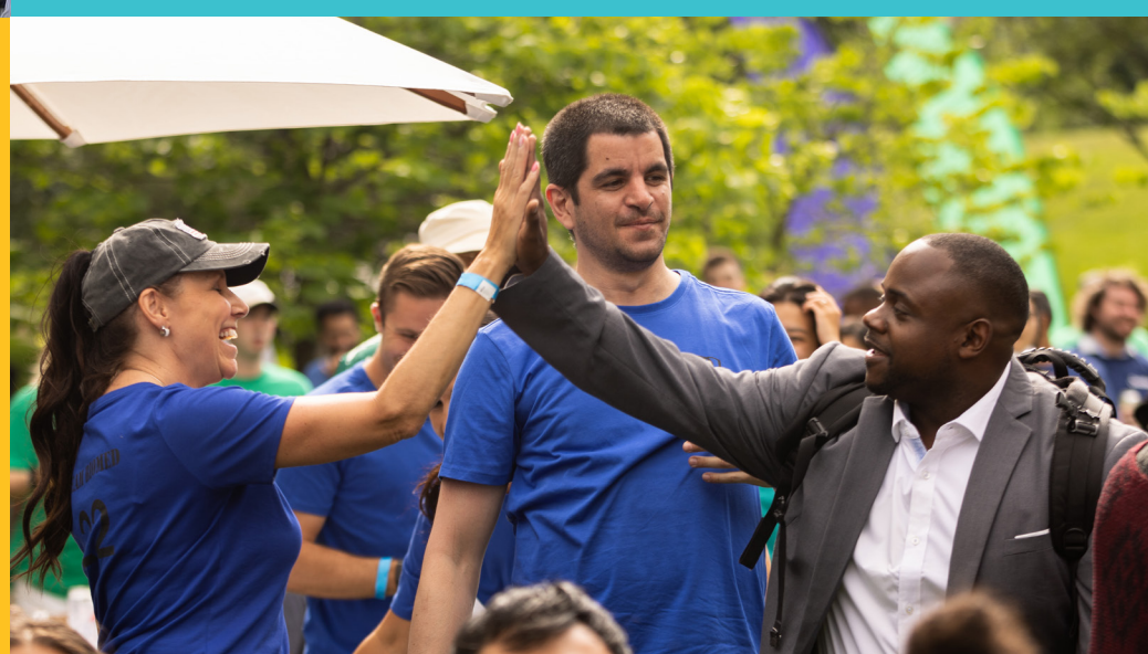
KSA is a nonprofit business association founded in 2009 under 501(c)(6) to "improve, protect, promote the general economic welfare of the area known as Kendall Square in Cambridge"

General Manager at CIC/Cambridge Innovation Center and Member of KSA's Future of Work Task Force